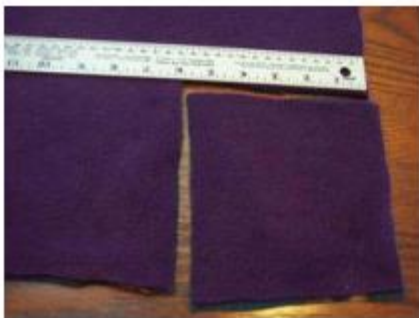
Cut out a 6" square from each corner.