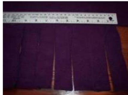
Cut fringe that is 4" deep and 1" wide.